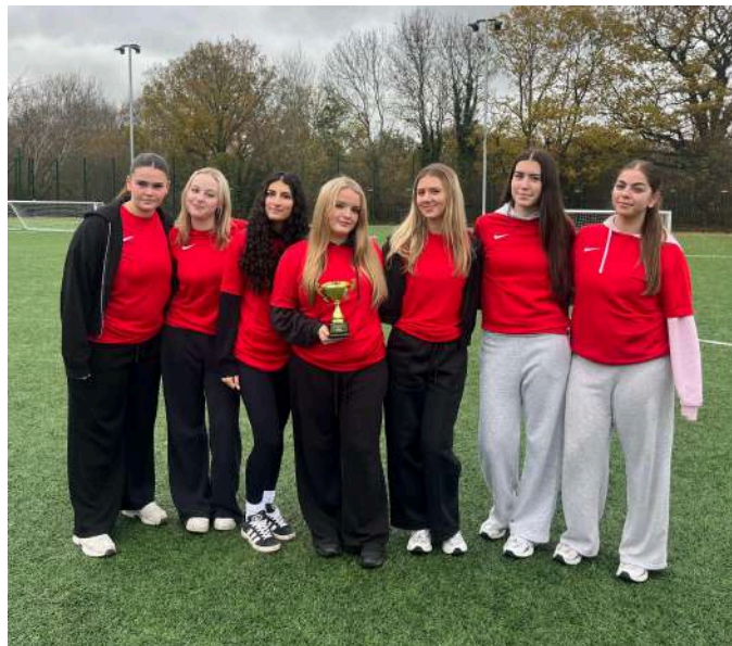
Girls: 1st: Rowan, 2nd: Beech, 3rd: Oak and 4th: Willow