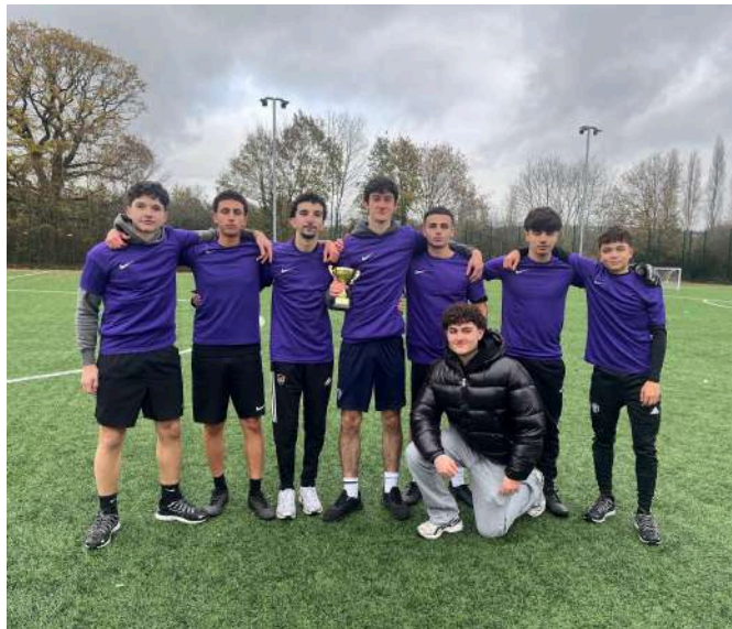
Boys: 1st: Oak, 2nd: Beech, 3rd: Willow and 4th: Rowan

In the girls' final, it was Rowan who took home the trophy after thrashing Beech 5-0 in the final. Well done to all of the players who took part.